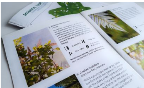
Location: Kaipūpū Sanctuary