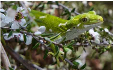
Location: 48 Elliot Street, Grovetown, Blenheim