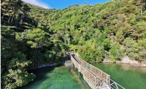
Location: Kaipūpū Sanctuary