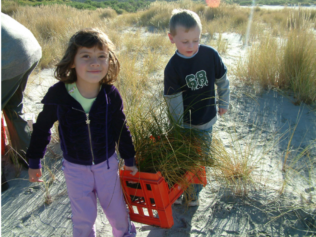
Caption: Children planting pingao as part of a community dune restoration project in Otago. Community initiatives to conserve biodiversity have blossomed in recent years, helped by central and local government funds.