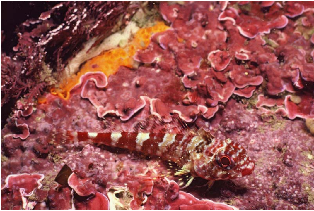
Caption: Scaly-headed triplefin. New Zealand's marine environment is much larger than its land area and is home to significantly more species. But our knowledge of marine biodiversity and marine processes is relatively poor.