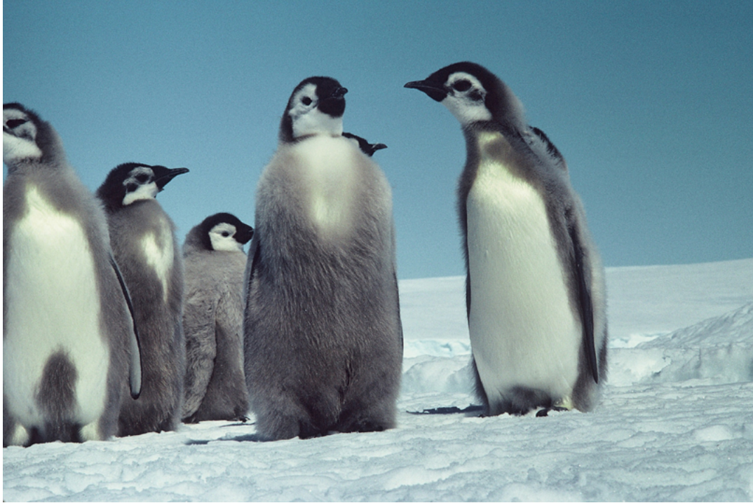
Caption: Young Emperor penguins on Dumont d'Urville, Antarctica. New Zealand's direct involvement with international responsibilities for biodiversity extends from the cold of Antarctica to the tropical islands of the Pacific – and beyond.