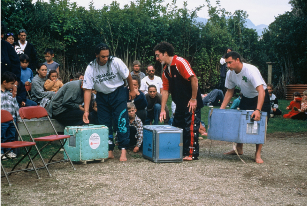
Caption: Ngati Kua taking delivery of three female kakapo transferred from Little Barrier Island, to Maud Island, 15 May 1998. Many iwi have protected large areas of Maori-owned forests and are increasingly involved in pest management and recovery projects for taonga species.