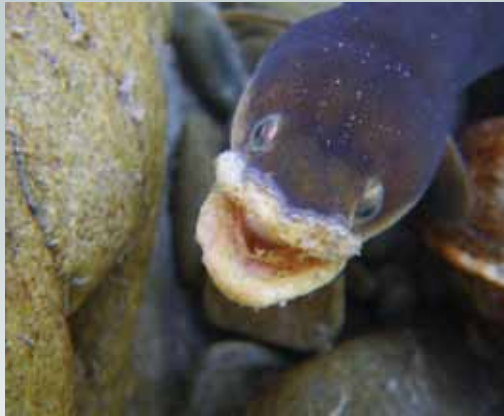
Tuna pakikau roa me te hekaheka i ngā ngutu.

Mā te tuna ia ka mōhiotia e te iwi te kounga o te wai me te nōhanga. Nā te mea ka raru te tuna pakikau roa i te para, ko tō rātou oranga tētehi tohu o te oranga o te rohe e noho rā rātou. He mea āta tiro tiro te tuna mehemea kua pā te mate ki te kiri, ki ngā pakikau me te waha. I te wā ka kino te paru o te wai, ka kapi katoa ngā ngutu o te tuna i te hekaheka, ā, e kore pea e taea e ia te kai. Ki te pērā rawa te kino, ko te mate pea te otinga atu.