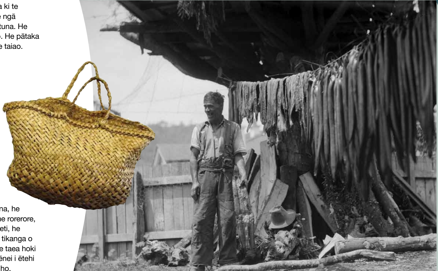
Te Whakatuwheratanga o Raukawa, Māehe 1936.

tauhokohoko. Ahakoa rā, he rōnaki tonu te heke haere o te tuna. Nā konā kua whakatau ētehi iwi ki te whakaiti i te hopunga, ki te whakatū rāhui rānei i ō rātou rohe. He maha tonu ngā iwi huri noa i te motu kua tatū kia kua e mau i a rātou te rahinga tauhokohoko kua tohua ki a rātou, mei kore tēnei e āwhina ki te whakapiki ake i te rahi o te tuna tērā e mau mō ngā hui.