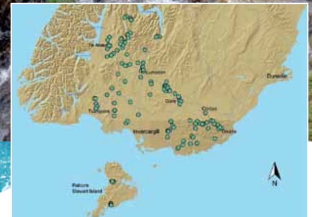
Locations of Gollum galaxias