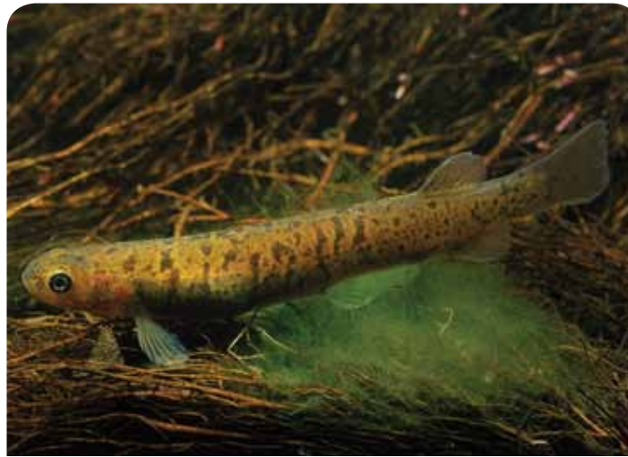
Gollum galaxias

Gollums can be seen in the slower margins of waterways, lurking in ponds or ditches amongst aquatic plants or woody, leafy matter. This unique species is fast disappearing though, classified as 'At Risk: Declining'.