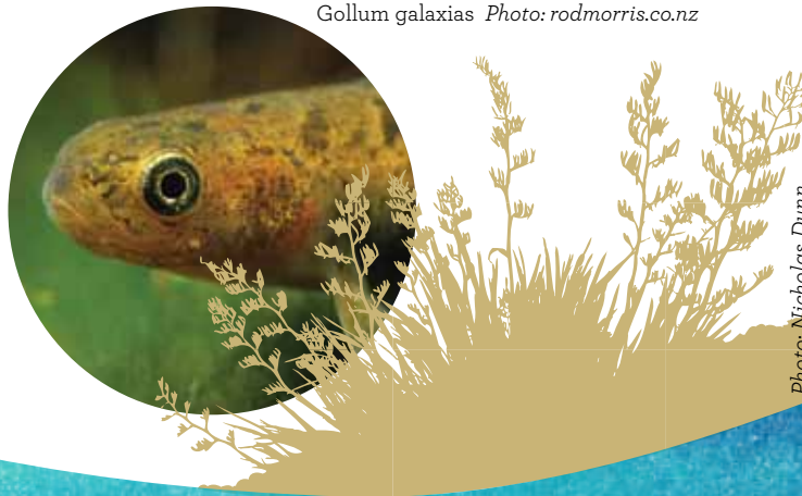
Gollum galaxias

Gollums can be seen in the slower margins of waterways, lurking in ponds or ditches amongst aquatic plants or woody, leafy matter. This unique species is fast disappearing though, classified as 'At Risk: Declining'.