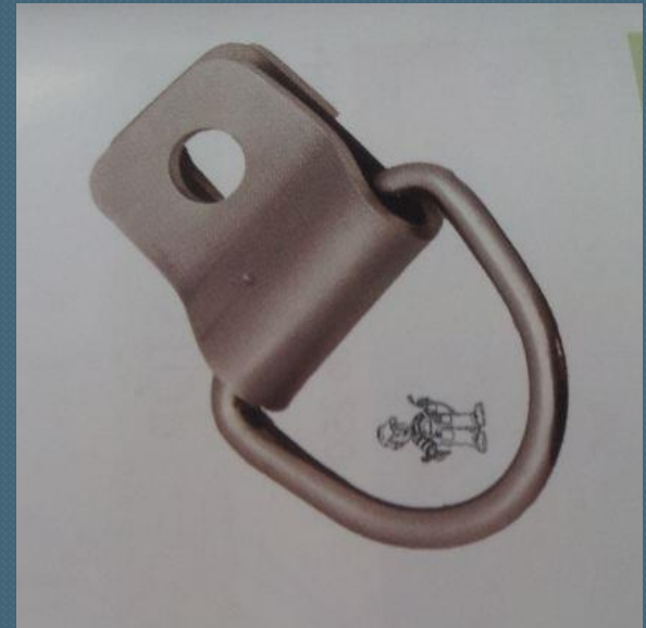
D-Ring & clasp