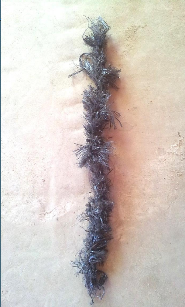
Super-Christmas tree rope