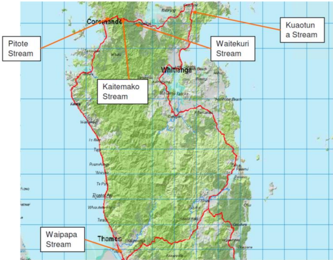
Figure 1: Locations of selected sites