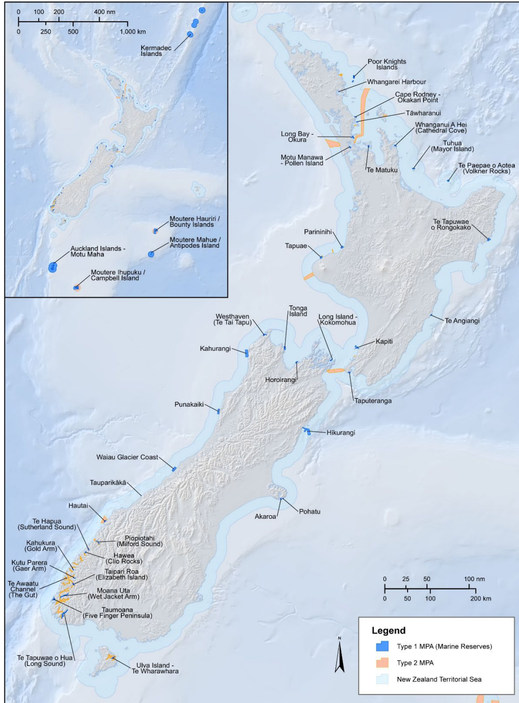
Figure 2: Marine Protected Areas in New Zealand - Type 1 (Marine reserves) and Type 2 MPAs, at December 2020.