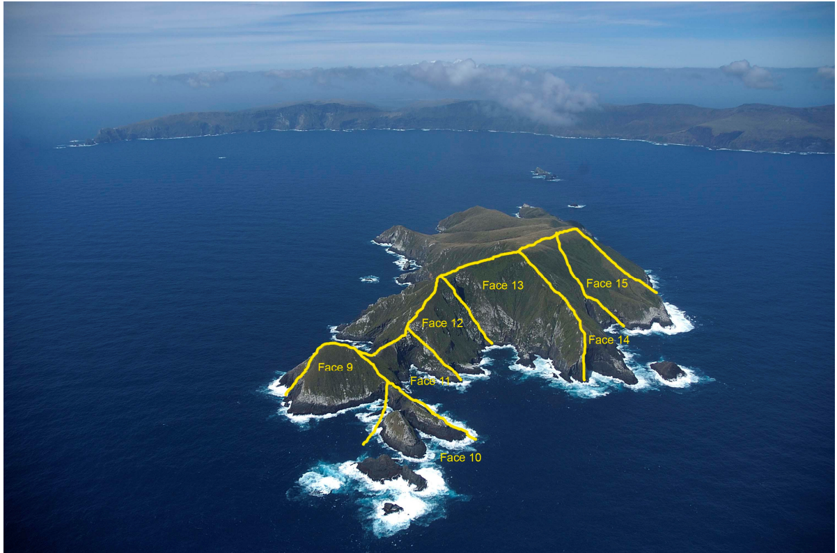
Figure 2. Boundary of photographic montages 9 to 15, Disappointment Island