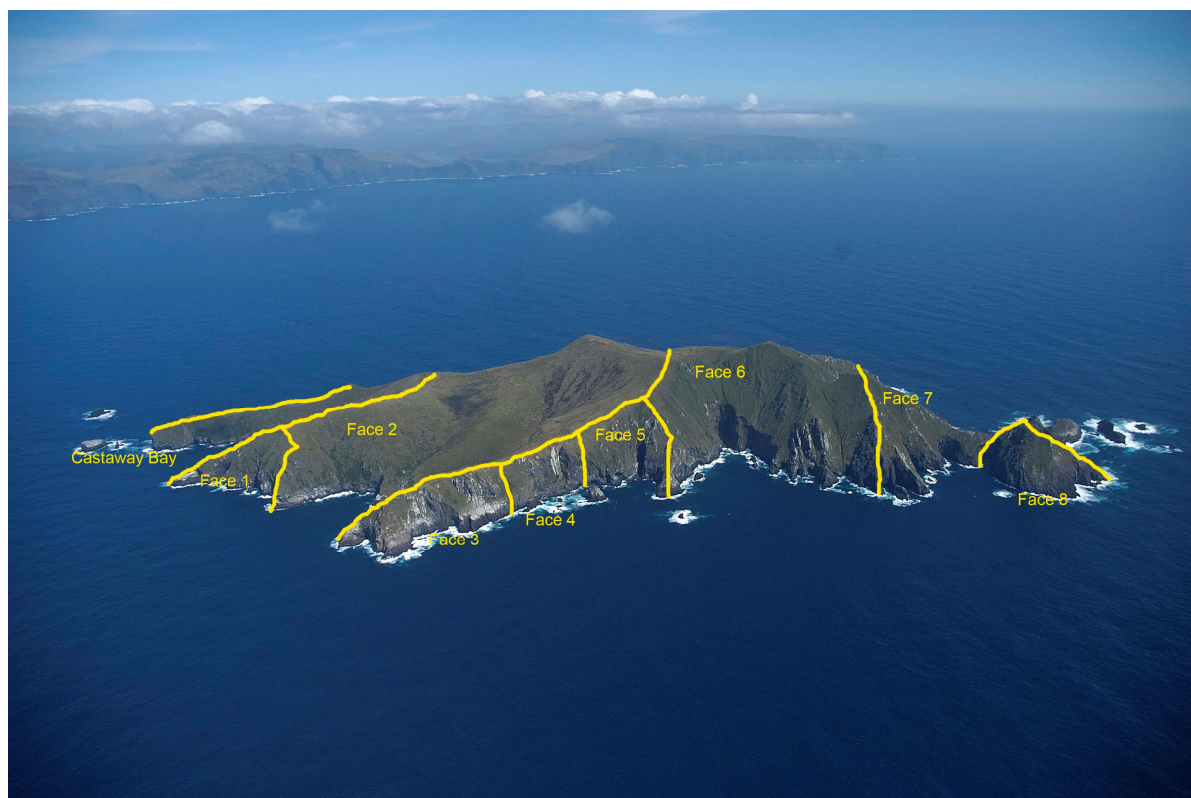
Figure 1. Boundary of photographic montages 1 to 8 and Castaway Bay, Disappointment Island