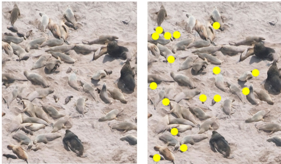
Figure 3. Photomontage of New Zealand sea lion colonies before (left) and after (right) counting. The yellow circles are animals identified as pups.

We used protocols previously developed for aerial censuses of albatross colonies (Arata et al. 2003; Robertson et al. 2007; Baker et al 2011), fur seals (Baker et al. 2010) and for sea lions in 2012 (Baker et al 2012). Photographic montages of all sea lion colonies were constructed from overlapping photographs using the image editing software package ADOBE PHOTOSHOP ( http://www.adobe.com/ ). Counts of all pups and other sea lions on each montage were then made by magnifying the image to view sea lions and using the paintbrush tool in PHOTOSHOP to mark each animal with a coloured circle as they were counted ( Figure 3 ). To assist with counting we used a hand held click counter. Once all sea lion pups had been counted on a photo-montage, the file was saved to provide an archival record of the count.