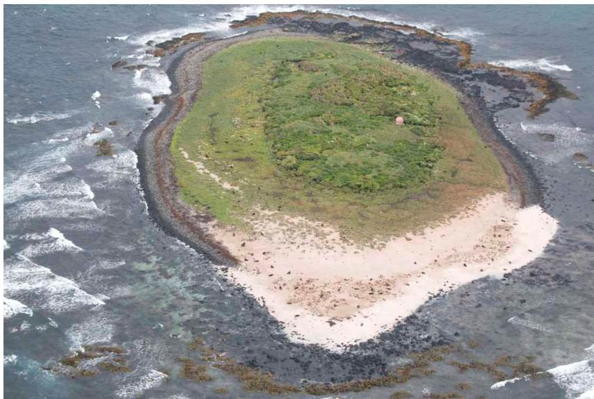
Figure 2. Dundas Island. New Zealand sea lions principally pup and mate on the sandy beach in the foreground. As the breeding season advances, females and pups move into the vegetation and can be found throughout the island.

The entire set of photographs was downloaded and subsequently replicated to ensure that adequate back-up sets were available for storage in at least three different locations. A full collection of photographs have been submitted to the Department of Conservation for archiving.