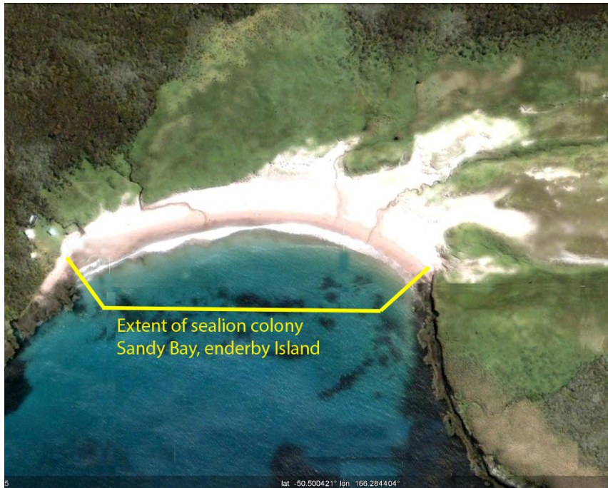
Figure 1. Sandy Bay, Enderby Island showing extent of New Zealand sea lion colony