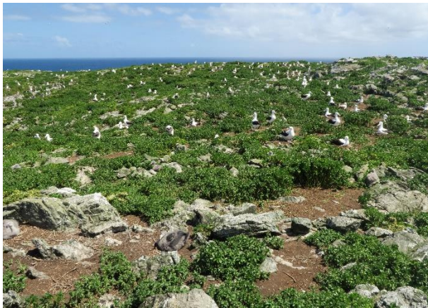
Figure 4. Photos of main Northern Royal Albatross breeding sub colony showing vegetation growth, Dec 2016.