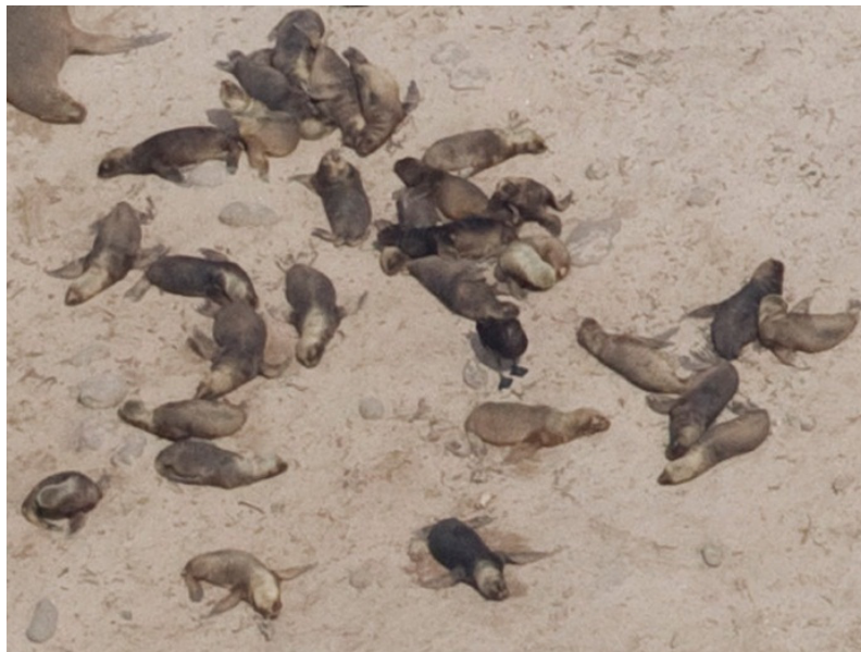
Figure 5. A pile of New Zealand sea lion pups on Sandy Bay Beach.

More work is desirable to understand the reason for the disparity between the Sandy Bay ground count and the one low aerial estimate, but the only plausible explanation would appear to be that pups were missed because they were hidden deep in pup piles. It is clear from the ground count undertaken on that day that all pups at Sandy Bay were still on the beach and had not moved on to the grass sward adjoining the beach, where they may have been more easily missed because of poor contrast. We had thought that by using photographs taken directly overhead the potential for underestimating pups in piles would have been greatly reduced, as the pups do not appear to be more than two or three pups high at the most ( Figure 5 ). Certainly, the use of multiple counters and analysis of four separate photographic runs taken on the beach that day provided remarkably consistent results.