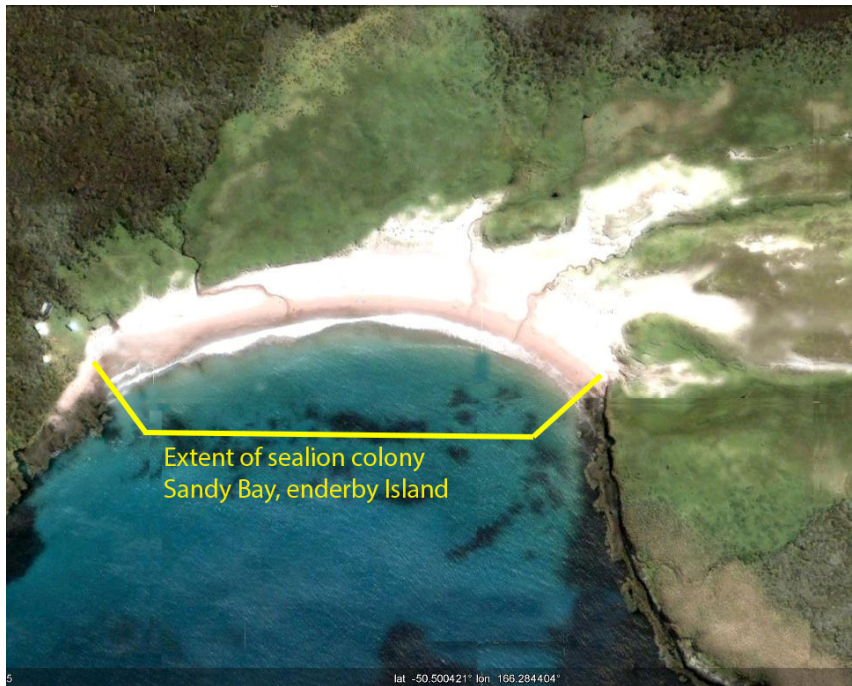
Figure 1. Sandy Bay, Enderby Island showing extent of New Zealand sea lion colony

the information being recorded. In all cases photography was carried out between 09.00 and 15.00hours.