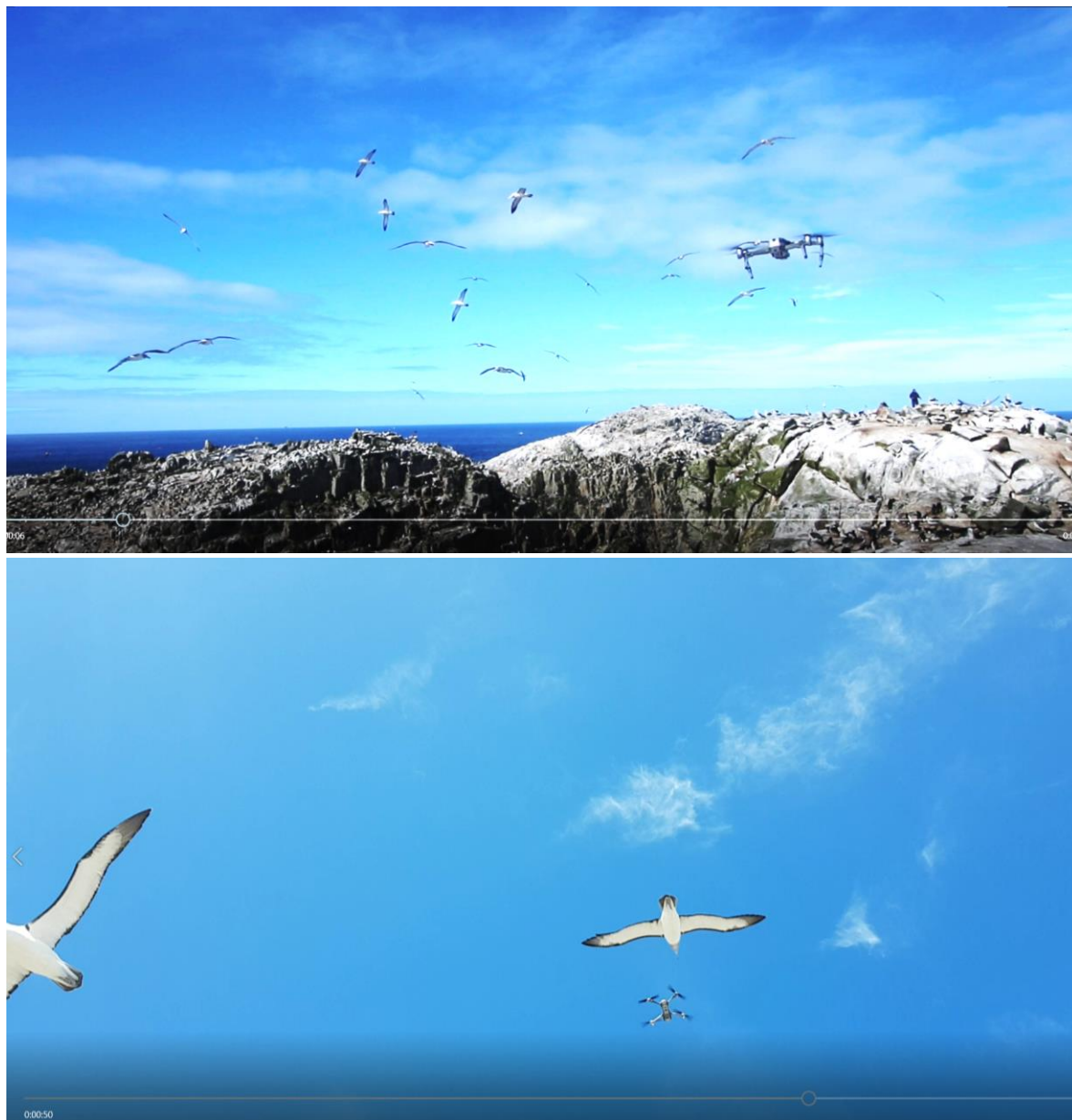
Figure 2. Drone launch (top) and landing (bottom) through busy airspace after a north-westerly front. Screen grabs from monitoring footage.