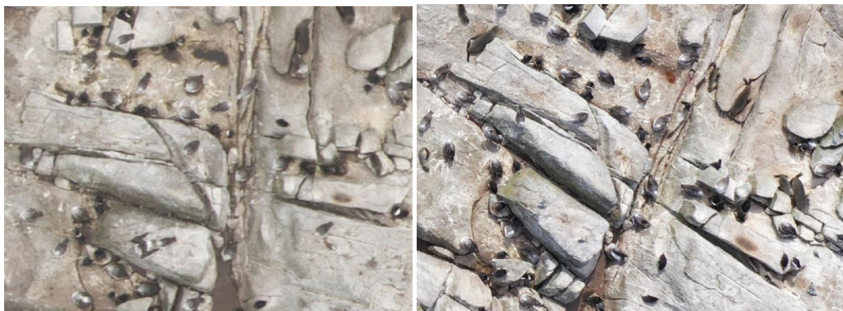
Figure 5. Same location on Proclamation. Left: section of image from fixed-wing plane at 400m (October 2018). Right: section from image by drone at 40m flight height (Oct 2019).

Drone-camera technology is advancing rapidly, so resolution could be improved by via drone that can carry other lenses. The drone-camera technology is advancing rapidly. A photographer in a plane can simply switch to a different lens. An example of close-up photos using a 300mm f4 PF telephoto lens is on the cover of Baker and Jensz (2019), showing similar resolution to the 40-m drone overflight below (Fig. 5 right).