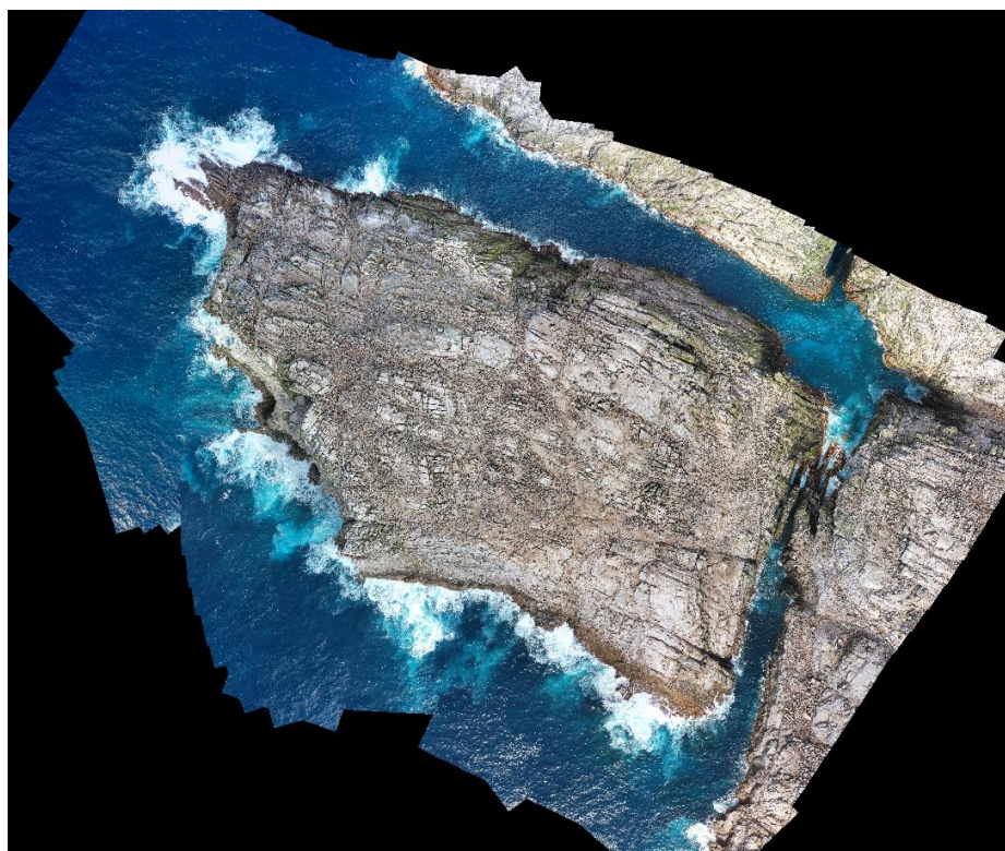
Figure 3. Composite image of Proclamation Island from 40m drone overflight.

Pre-programmed saved flight grids for the islands were particularly helpful. Despite testing various methods to make background maps available offline for flight planning once at the islands, maps were not available. Without background maps, flight planning for new areas involved trial and error, and more battery use.