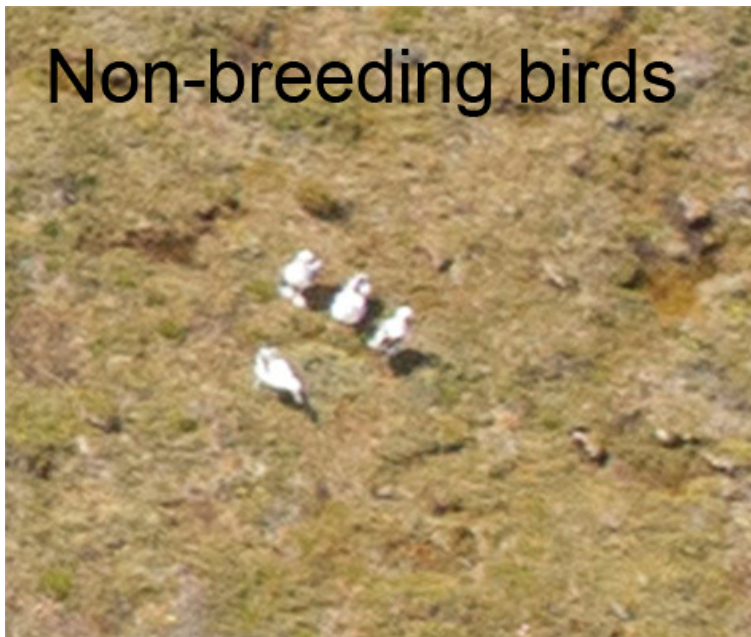
Figure 3. Examples of images of southern royal albatrosses and their breeding status assessed from aerial photographs.