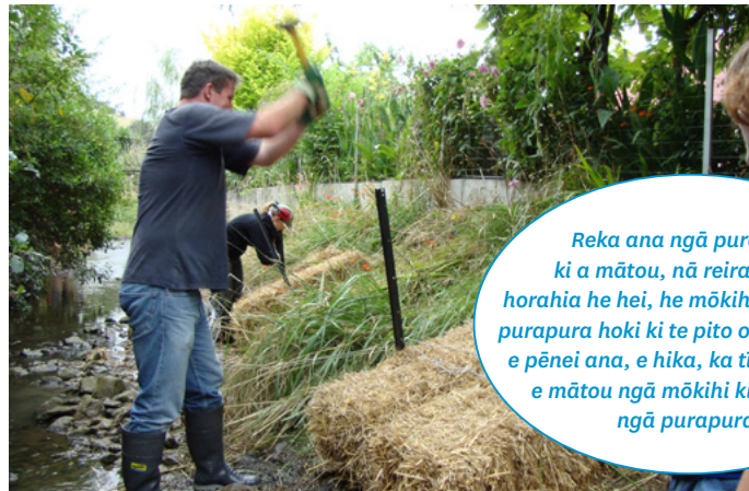
Te whai kia mau pai ngā mōkihi tākakau.

Reka ana ngā purapura ki a mātou, nā reira kaua e horahia he hei, he mōkihi tākakau he purapura hoki ki te pito o ngā tātā. Me e pēnei ana, e hika, ka tīhaeaengia e mātou ngā mōkihi kia kitea ai ngā purapura.