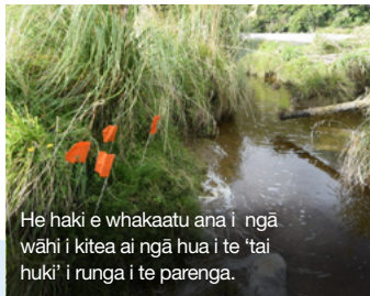
He haki e whakaatu ana i ngā wāhi i kitea ai ngā hua i te 'tai huki' i runga i te parenga.