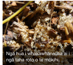
Ngā hua i whakawhānautia ai i ngā taha roto o te mōkihi.

Ka tae ki Matariki (kei waenga pū o Hune) kua whānau mai te nuinga o ngā hua, ā, kua wehe atu ngā punua i te manga. He wā pai kia unuhia ake, ā, kia whakawairākaitia ngā mōkihi tākakau – engari puritia te kōpare me ngā waratā mō te tau e heke mai ana.