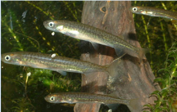
Ka eke ki te 10 cm te roa o te inanga pakeke (mārearea).