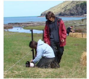
Te taiapa i tētahi wāhi pai hei whakatō tupu tūturu.

Ka kite pea koe he nui ake ngā hua ka whakawhānautia ki runga i ētahi mōkihi tākakau i ō ētahi atu. Kei te wāhi tino tika ēnei mōkihi. Me mātua taiapa ēnei tū wāhi hei ārai atu i ngā kararehe kai noa, ā, me tiritiri taua wāhi ki ngā pātiti taketake, te harakeke me te toetoe.