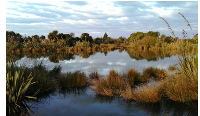
Ngā tupu kua whakaoratia i te awa o Avon/te wahapū o Ōtakaro.

Kia haumarua tō mahi haere i te taha awa. Kia tika ngā kākahu, kia aro ki te huarere me ngā tai.