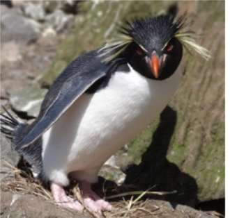
Eastern rockhopper penguin vulnerable to climate change as it relies on the sea's food resources