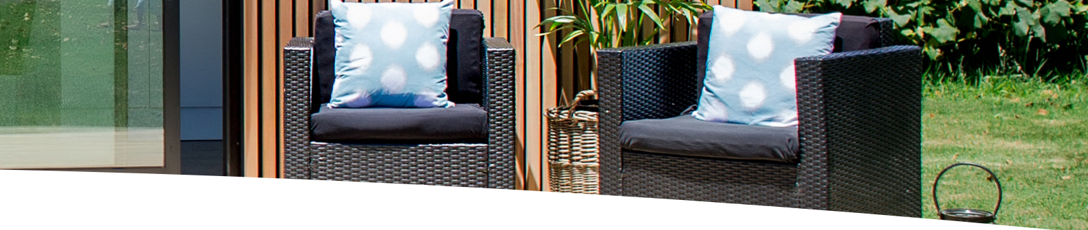
15m 2 POD - Bedroom, Ensuite & Kitchenette POD