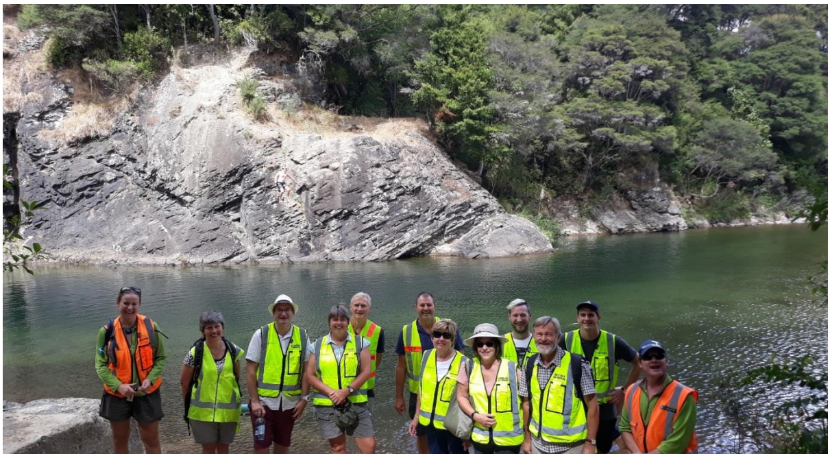
DOC staff/Waikato Conservation Board members at Hoffman's Paul, Jauaeranga Valley, Thames, March 2019.

The DOC Operations Manager, Hauraki joined members for part of the meeting where discussions included mining/blasting on/or under Public Conservation Land, impact on biodiversity, the critically endangered Archey's frog, Predator Control 2050 and ongoing resourcing for predator control/infrastructure.