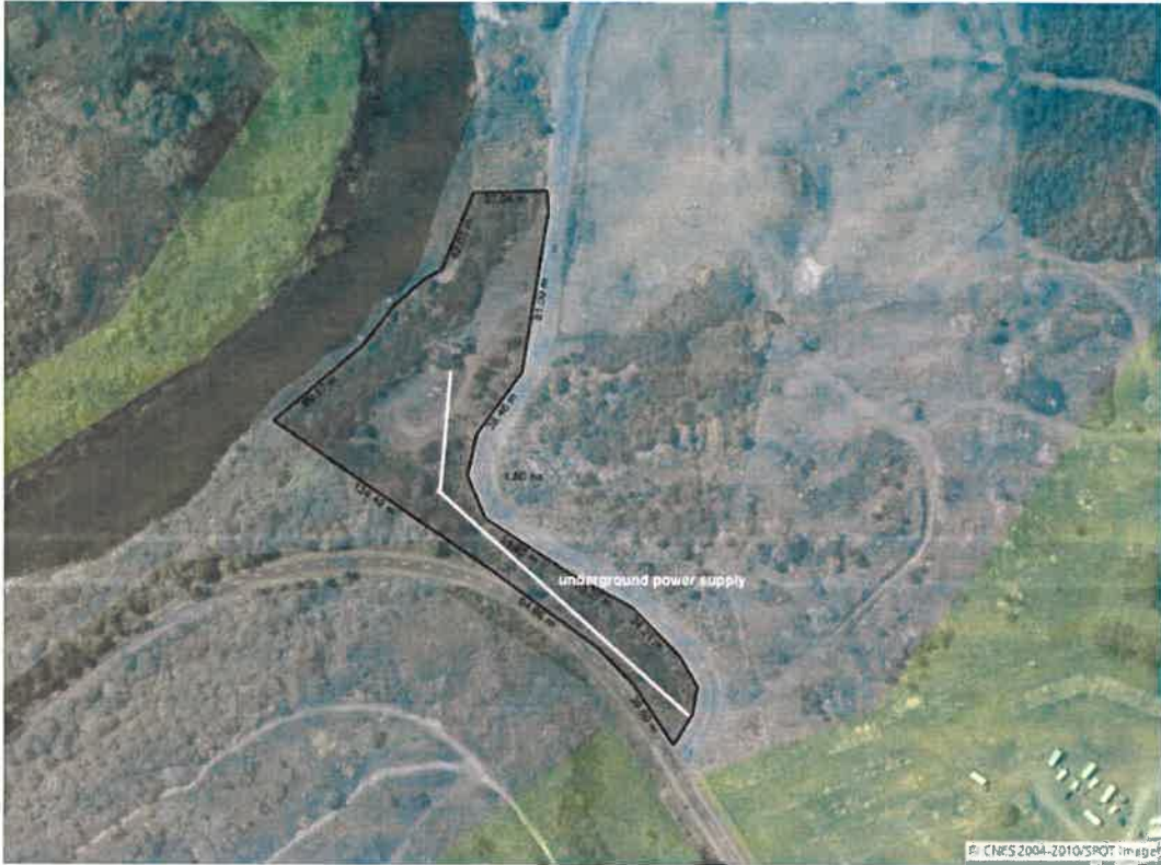
Proposed lease area and location of the underground power cable