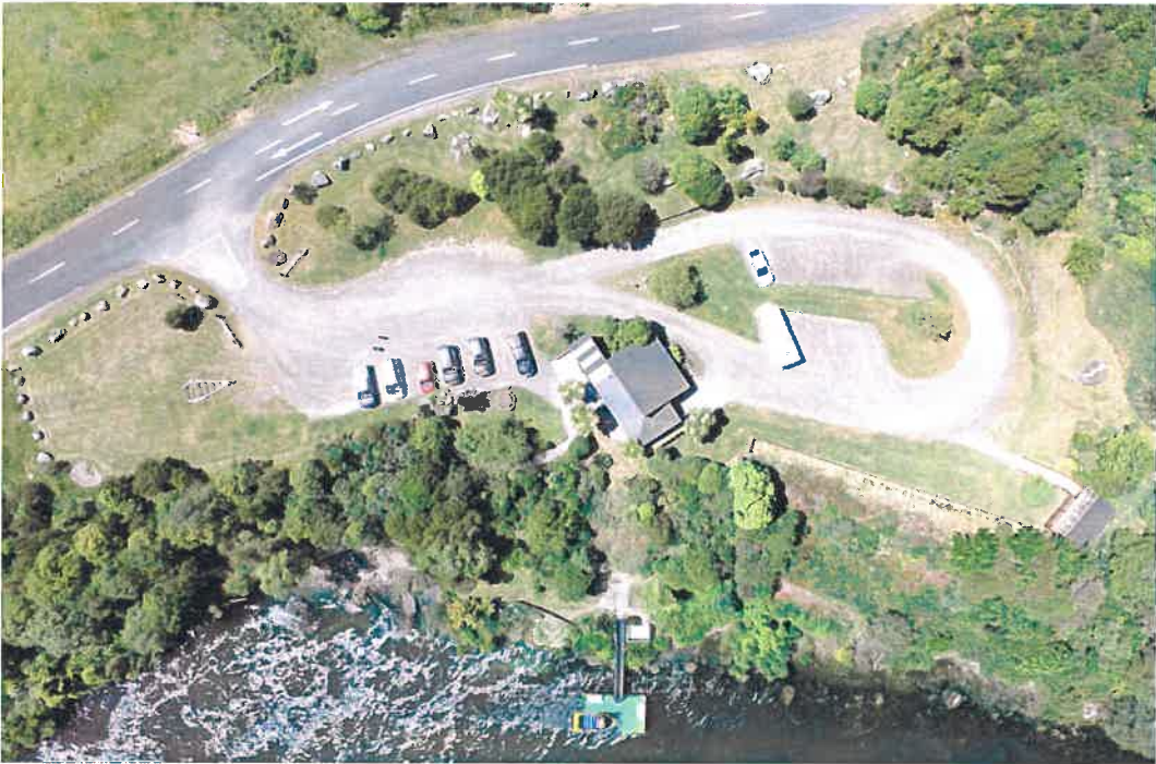
Current facilities on the lease area