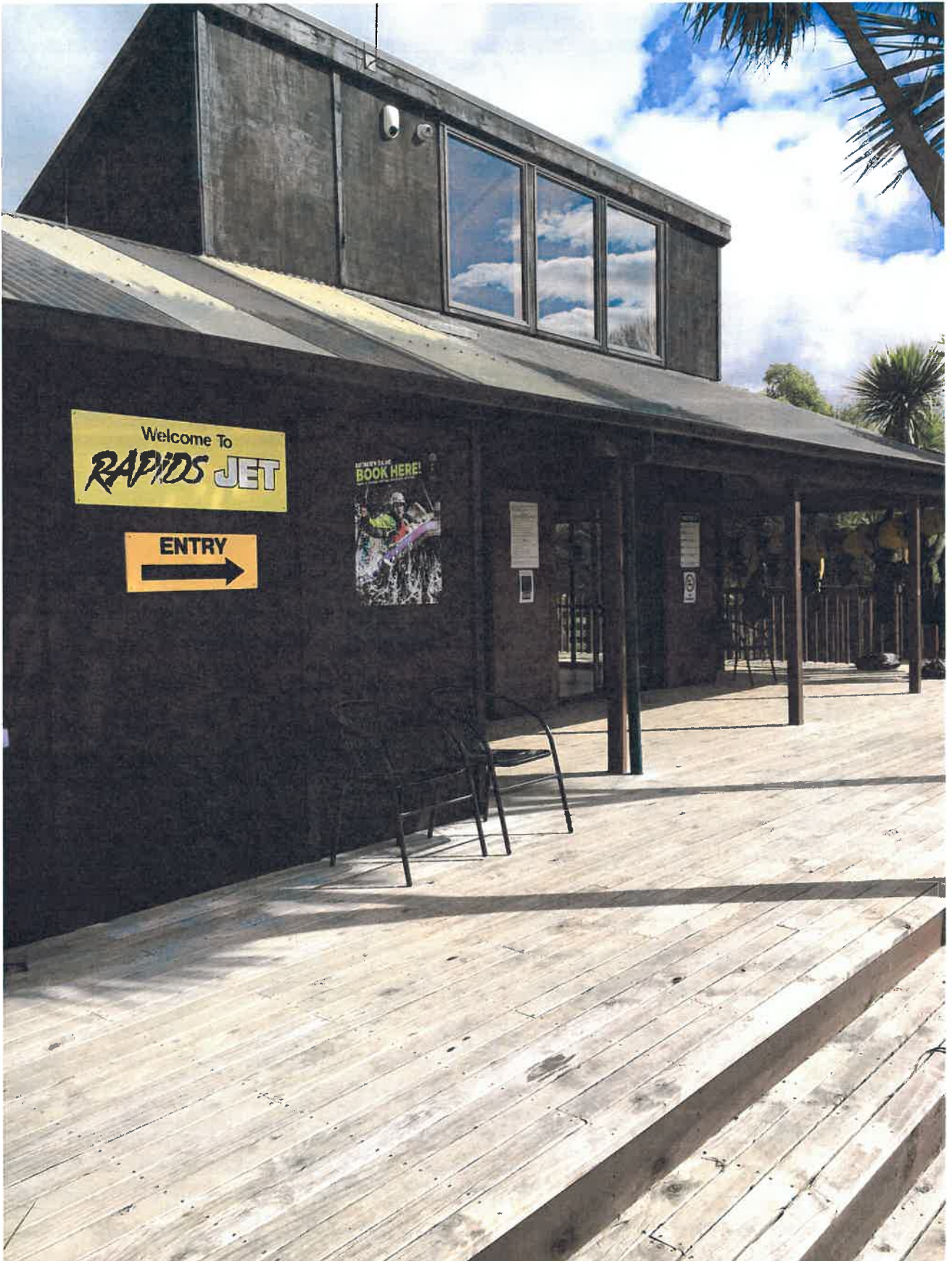
Front of existing office with deck