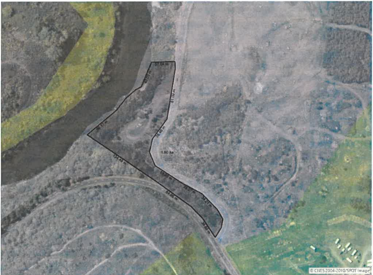
Proposed lease area - Aratiatia Rapids Recreation Reserve

The fuel required to operate the jet boats is bought on site each day in approved 20 litre fuel containers. These containers are placed in a fuel storage shed. The necessary fuel is carried down the walking track to the jet boat as required. All containers are removed from the site at the end of the day.