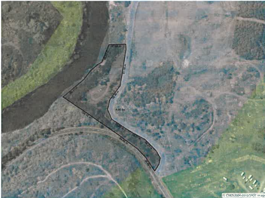
Proposed lease area - Aratiatia Rapids Recreation Reserve

This environmental impact assessment is prepared as part of the concession application.