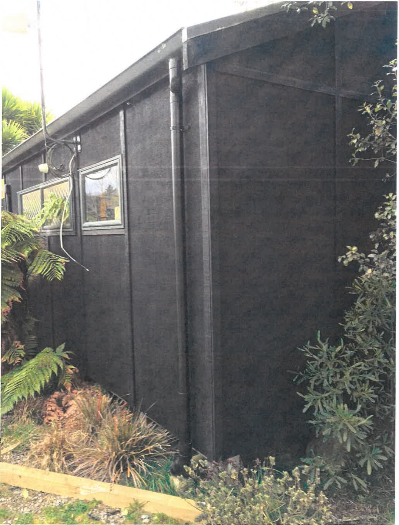
Detail of building construction and colour scheme