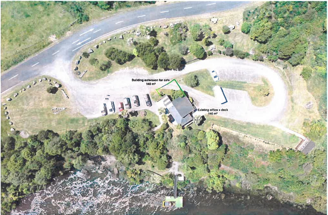
Location of facilities on the lease area