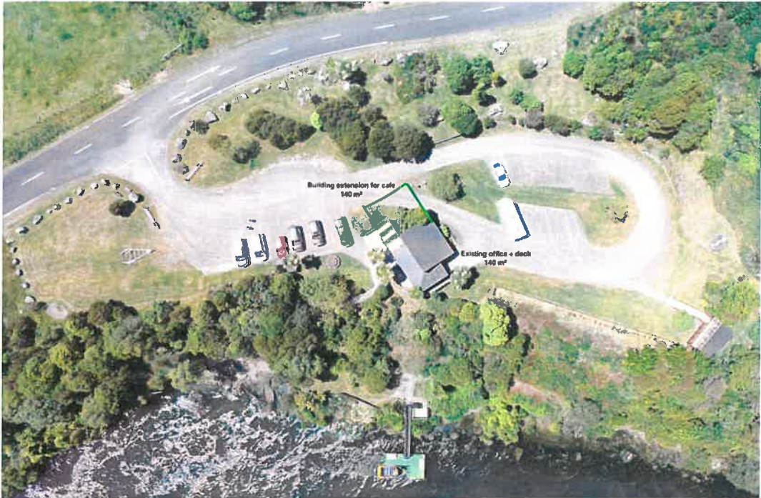
Location of proposed café on the lease area