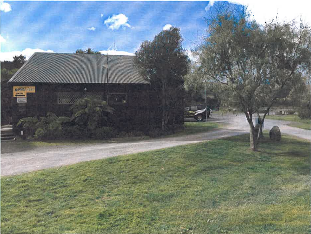
Existing building (cafe extension will be located to the right)