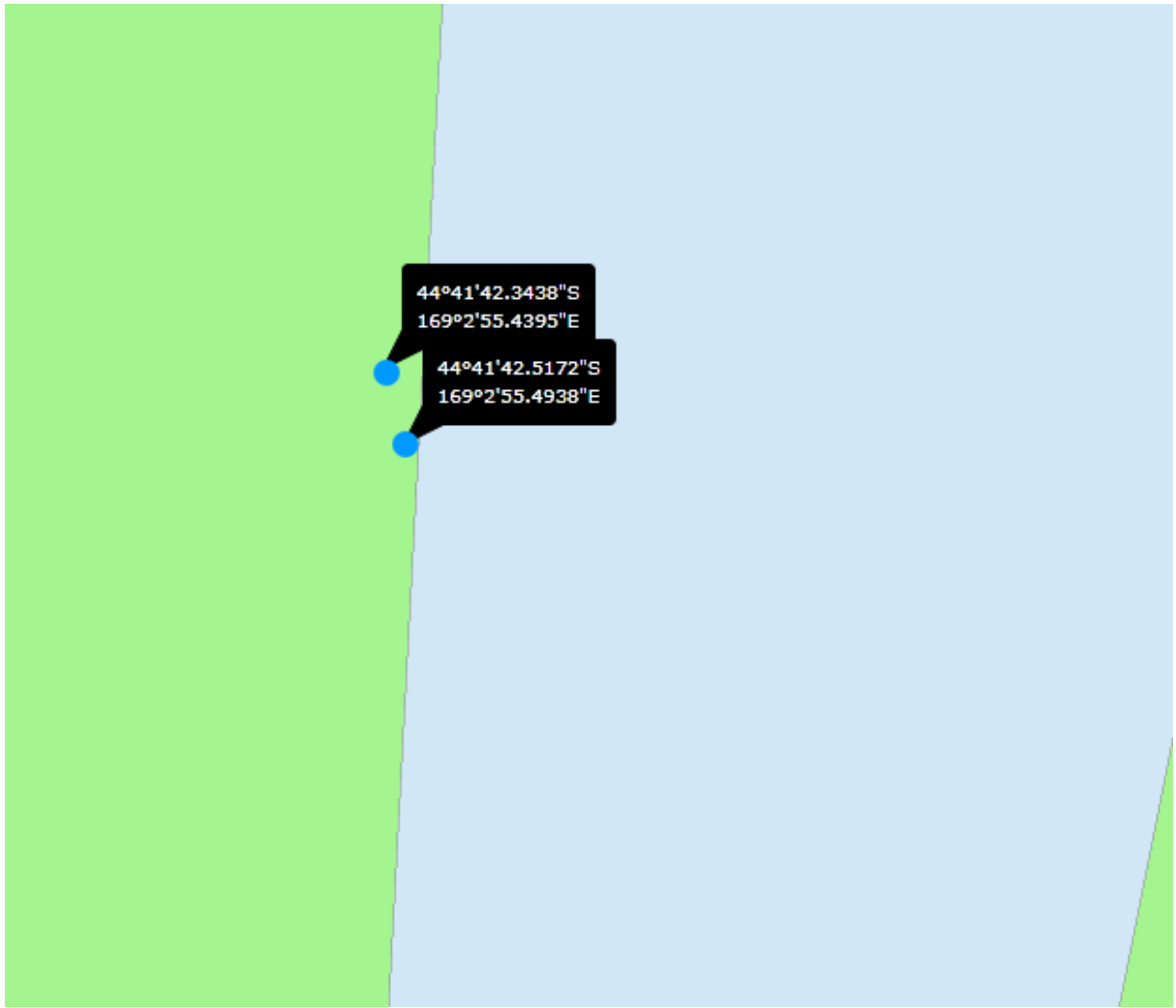
Close up of co-ordinates